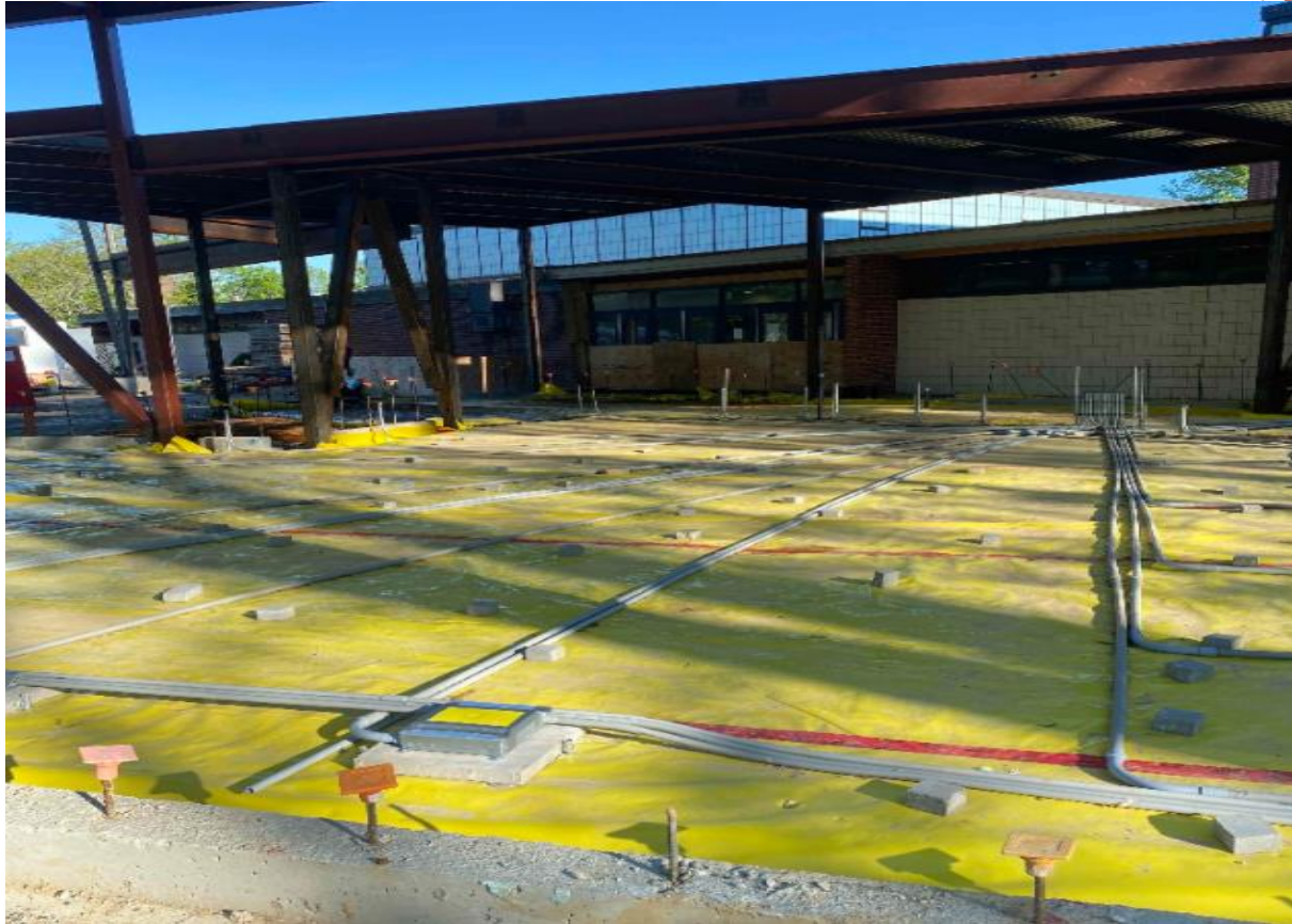
Under-slab vapor barrier and in-slab electrical conduit