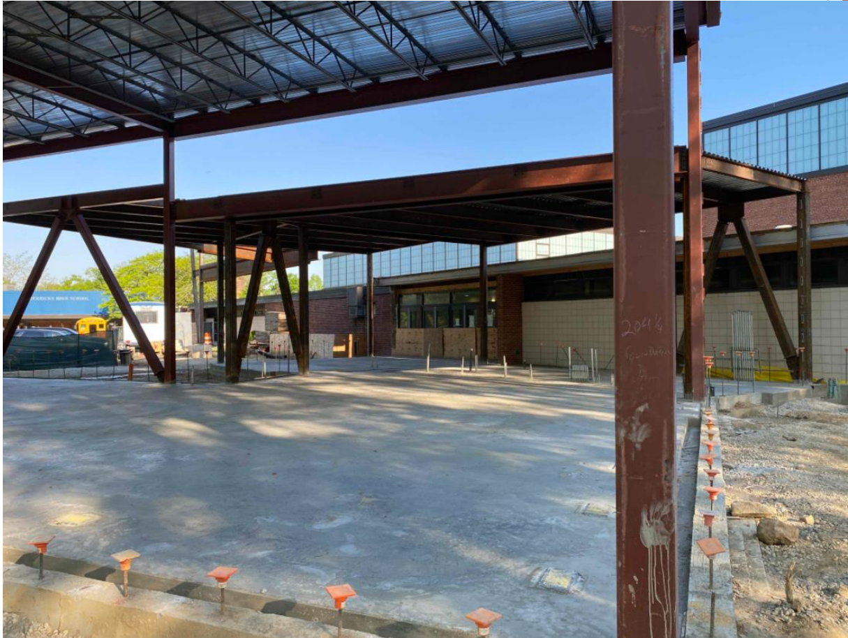
Concrete Slab Poured