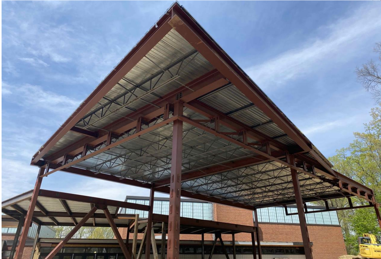
Completed Steel Columns, Beams, and Metal Decking