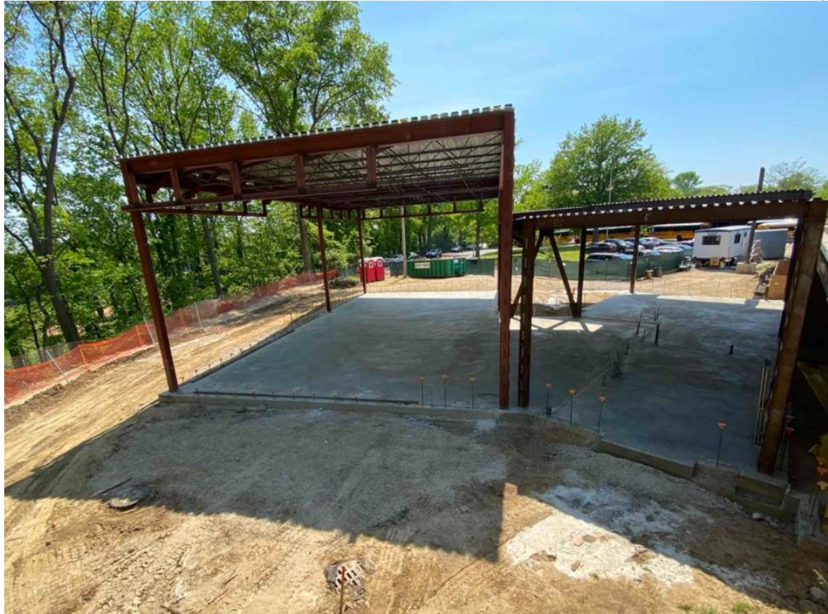
Concrete Slab Poured